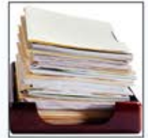
File Folders Office Papers