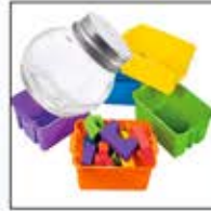
Plastic Tubs Screw-top Jars