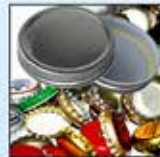
Loose Metal Jar Lids Steel Bottle Caps