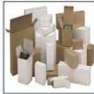
Paper Board Boxes