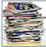
Magazines, Brochures & Catalogs