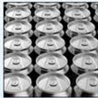
Cans (do not crush or flatten)