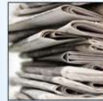
Newspapers & inserts