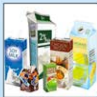
Paper Milk Juice Cartons