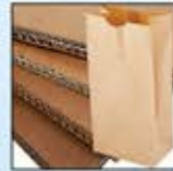
Corrugated Cardboard Paper Bags