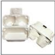
Paper Egg Cartons