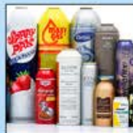
Empty Aerosol Cans (no caps)

Please flatten all cardboard boxes. Empty and rinse all containers.