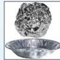
Balled Aluminum Foil (2" or larger) and Pie Pans