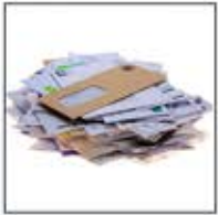
Open Mail Greeting Cards

YOU CAN NOW PLACE ALL RECYCLABLES IN ONE BIN!