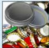
Loose Metal Jar Lids Steel Bottle Caps