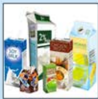
Paper Milk Juice Cartons