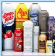
Empty Aerosol Cans (no caps)