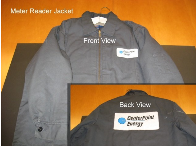
Meter Reader Jacket