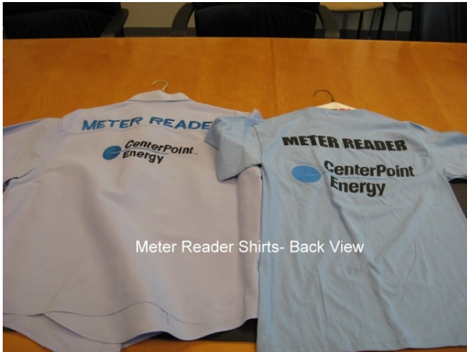
Meter Reader Shirts- Back View