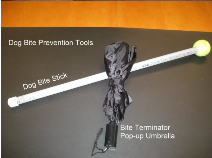
Dog Bite Prevention Tools