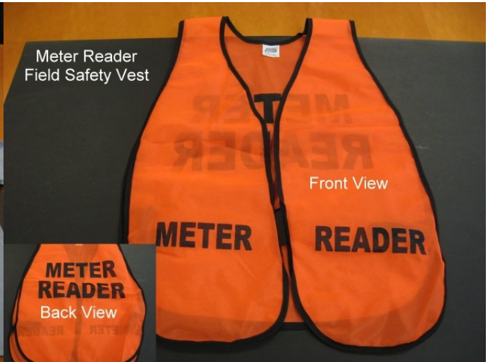
Meter Reader Field Safety Vest